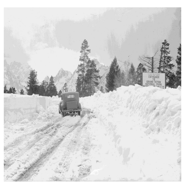
An adventurous tourist attempting to enter Grand Teton National Park!

Pick up your 2017 calendar at one of the following locations: