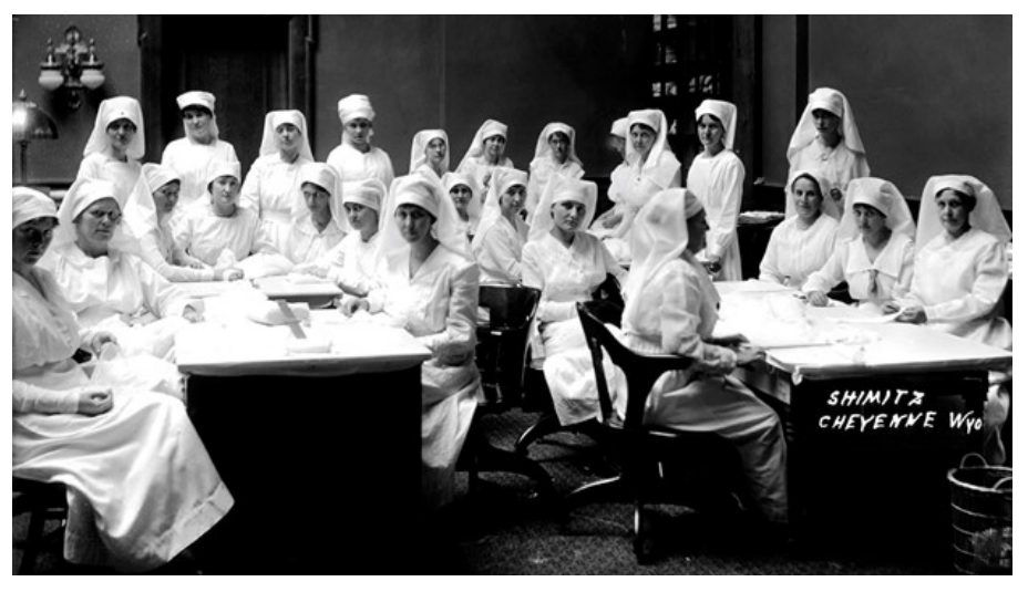
Red Cross nurses working in the Senate Chambers of Wyoming's Capitol building during World War I.

Get your 2018 calendars now — the images represent all aspects of Wyoming's history. Vendors and individuals can contact Society headquarters for ordering.