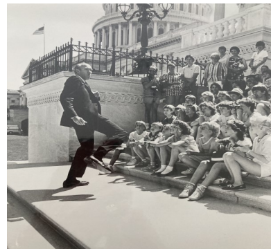
WSHS member Senator Al Simpson (Ret.) was a huge favorite for Wyoming History Day kids traveling to Washington, D.C. Here he demonstrates his favorite trick of flipping a silver dollar off his shoe into his shirt pocket.

We believe we can overcome each of these challenges. We submit them to you with a request. Is there one thing—big or small—that you personally would like to do to help us address these issues, either on a local, county, or state level? Working together, we can build a more vibrant Society.