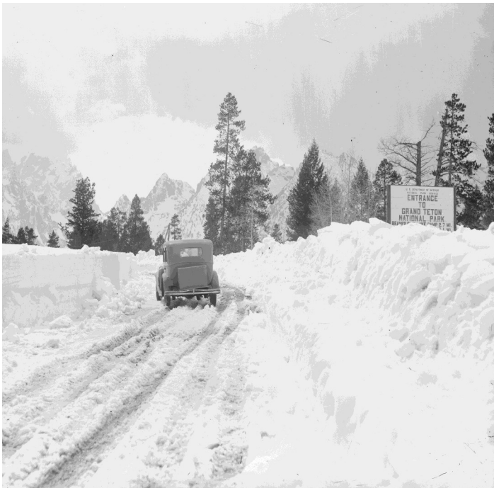
An adventurous tourist attempting to enter Grand Teton National Park!

Pick up your 2017 calendar at one of the following locations: